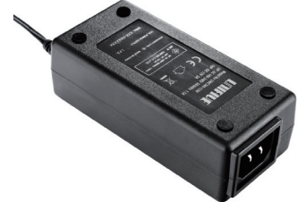
▲ UNDV C3060-XXXXXXPA