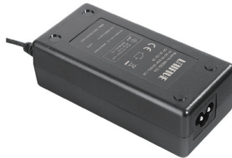
▲ UNDV B3060-XXXXXXPA